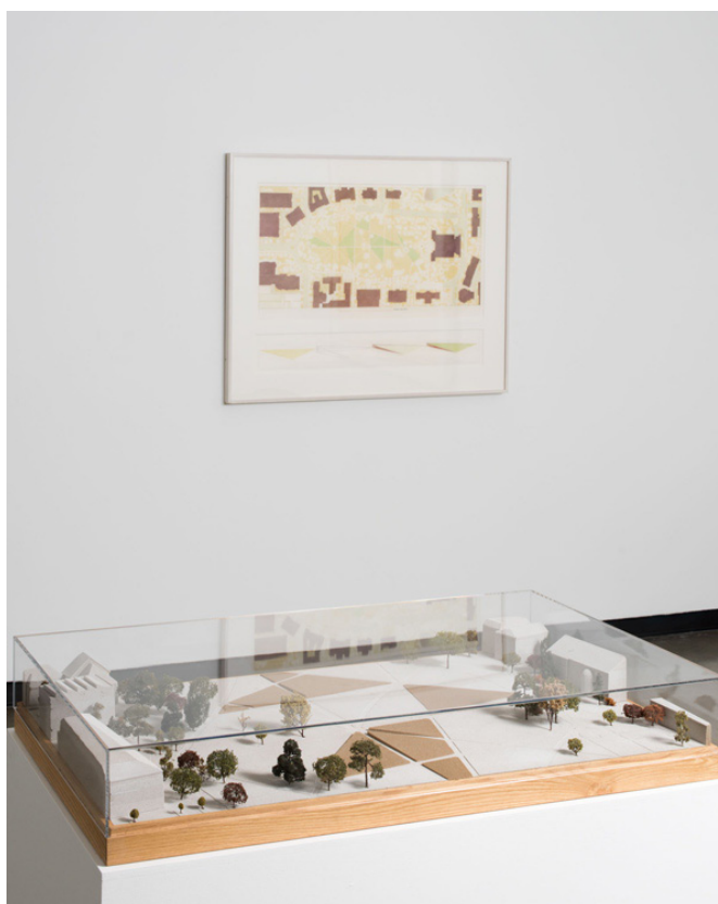
Installation image from Robert Irwin: Site Determined on view at UAM through April 15, 2018.