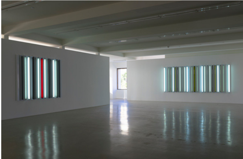
"Robert Irwin." Installation view, Sprüth Magers, Los Angeles, January 23 - April 21, 2018.