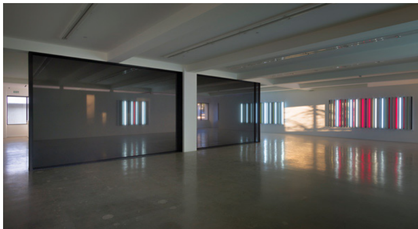
"Robert Irwin." Installation view, Sprüth Magers, Los Angeles, January 23 – April 21, 2018.

The installation at Sprüth Magers is a complex variation on the Dia installation that similarly uses space and divides it into rectilinear quadrants based on the support columns and ceiling grid of the room. The scrim, which is white and translucent, creates layers of geometric planes, which become more opaque in views where multiple planes overlap. Irwin has also painted square forms onto the scrim, creating a multitude of variations as one walks around and through the installation.