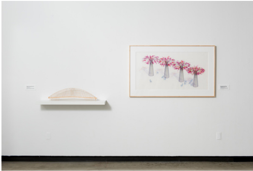
Installation image from "Robert Irwin: Site Determined," on view at UAM through April 15, 2018.