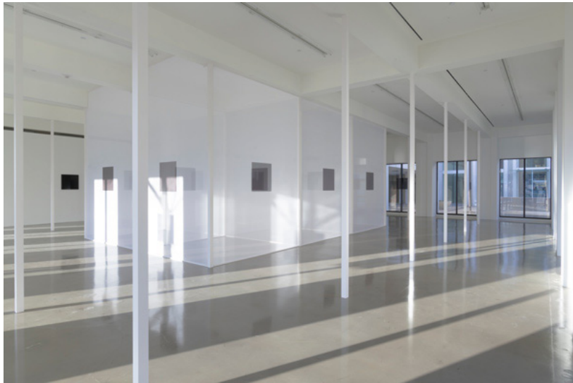
"Robert Irwin." Installation view, Sprüth Magers, Los Angeles, January 23 – April 21, 2018. Courtesy the artist and Sprüth Magers.

Of the many materials Irwin has worked with over the years, theatrical scrim is certainly one of the most beautiful. Irwin began using the material in the early 1970's, creating the ethereal Slant/Light/Volume at the Walker Art Center in 1971, and the more intricate Excursus: Homage to the Square 3 (1998) at the Dia Center Chelsea.