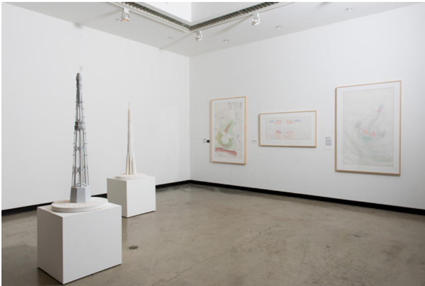
Installation image from "Robert Irwin: Site Determined," on view at UAM through April 15, 2018.

The concurrent "Site Determined" at Cal State Long Beach's University Art Museum documents four decades of the artist's outdoor projects through drawings and models; together, the shows are a unique opportunity to study the work of one of the greatest and most influential artists Los Angeles has ever produced.